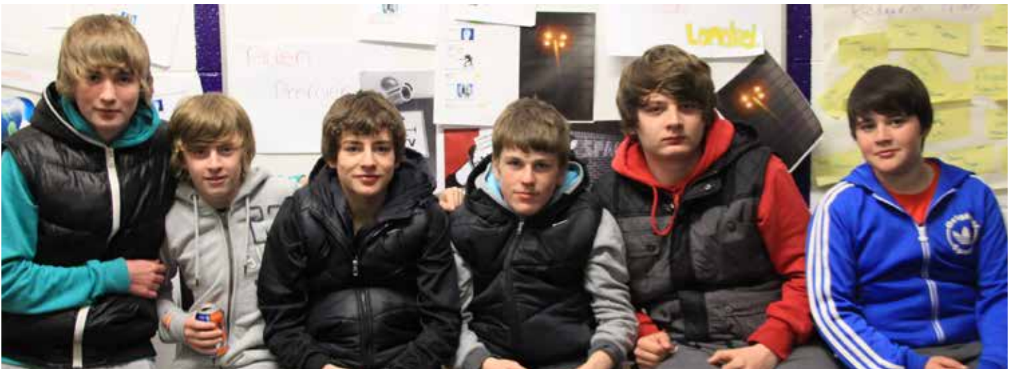
Jack Kane Community Centre