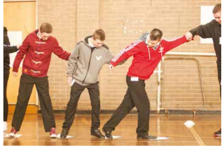
Youth work develops a wide range of skills recognised as important by employers

As we move forward, we know youth work organisations and the youth work sector is continuously engaging with young people and other professionals in innovative collaborative ventures with schools, colleges and key services around employability, sports, culture, health justice and many more.