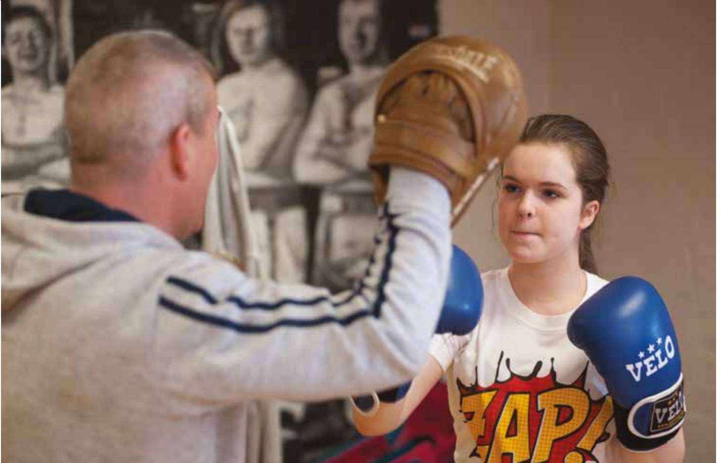
Youth work challenges stereotypes and promotes active lifestyles by introducing young people to a diverse range of physical activities