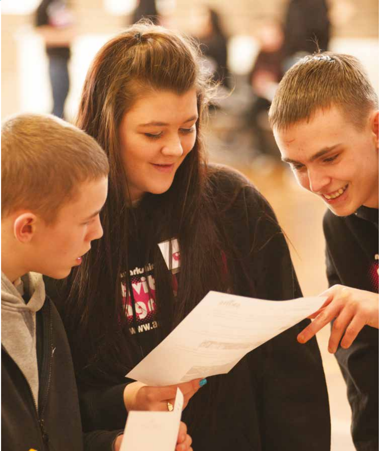
Youth work enables young people to take more responsibility for their own learning, training and employment