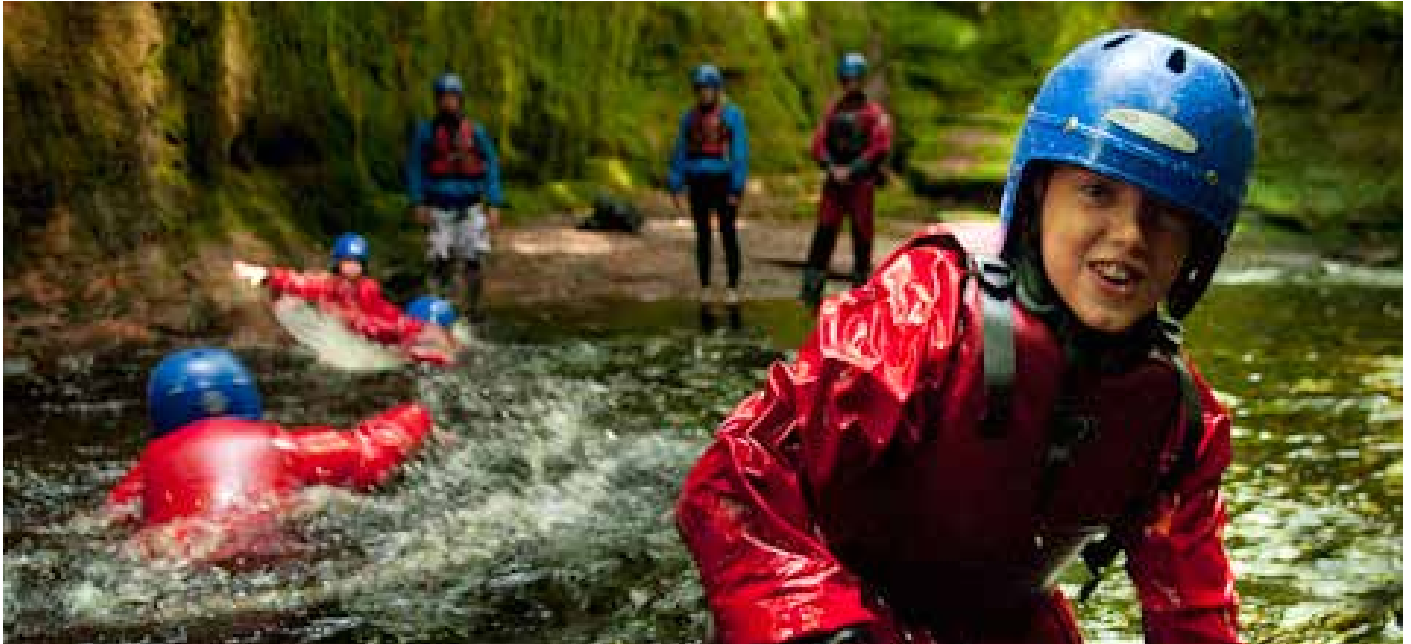
Youth work outdoors