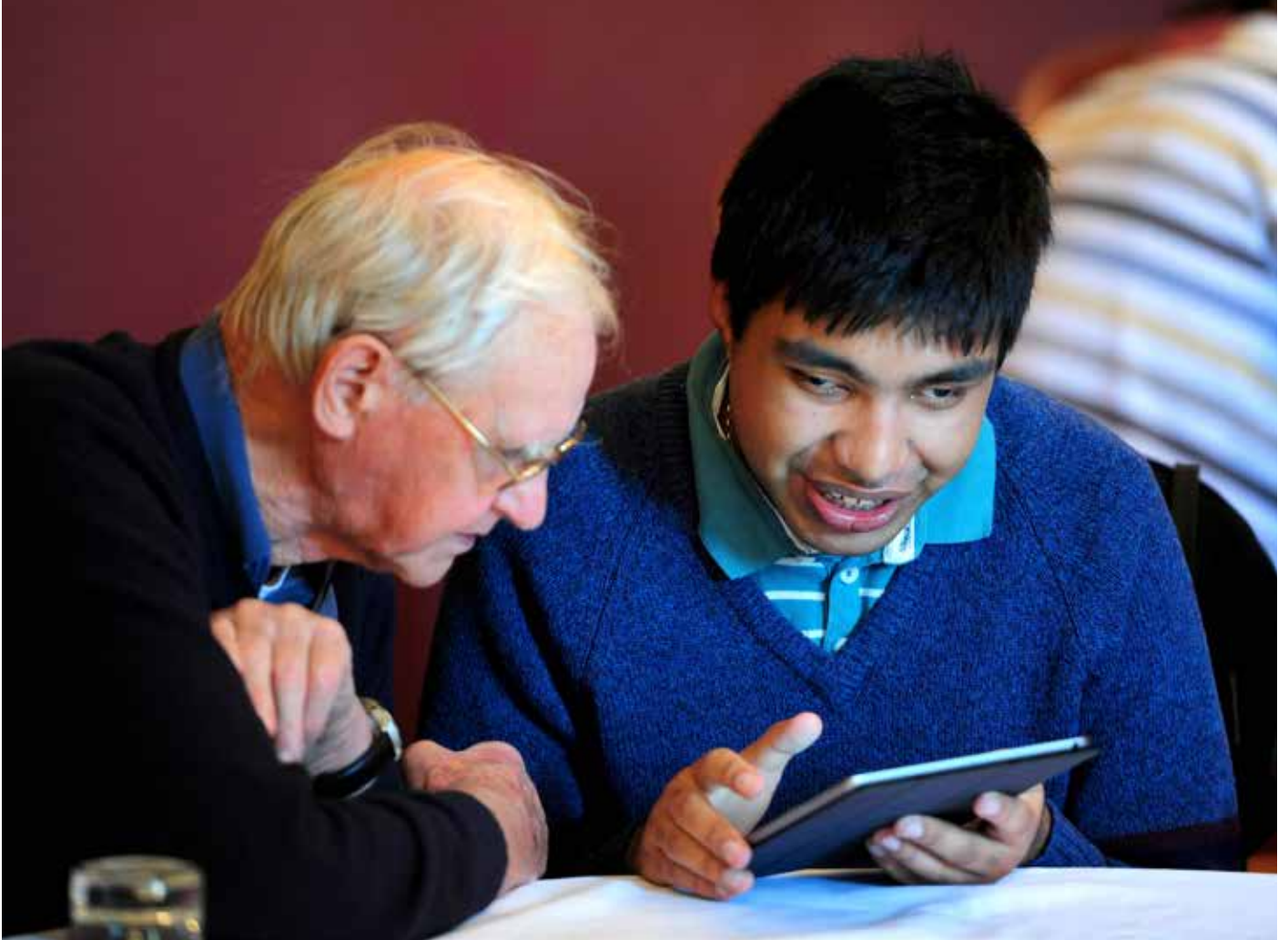
Overcoming challenges through digital technologies