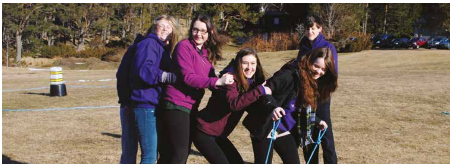
Duke of Edinburgh's Award Scotland