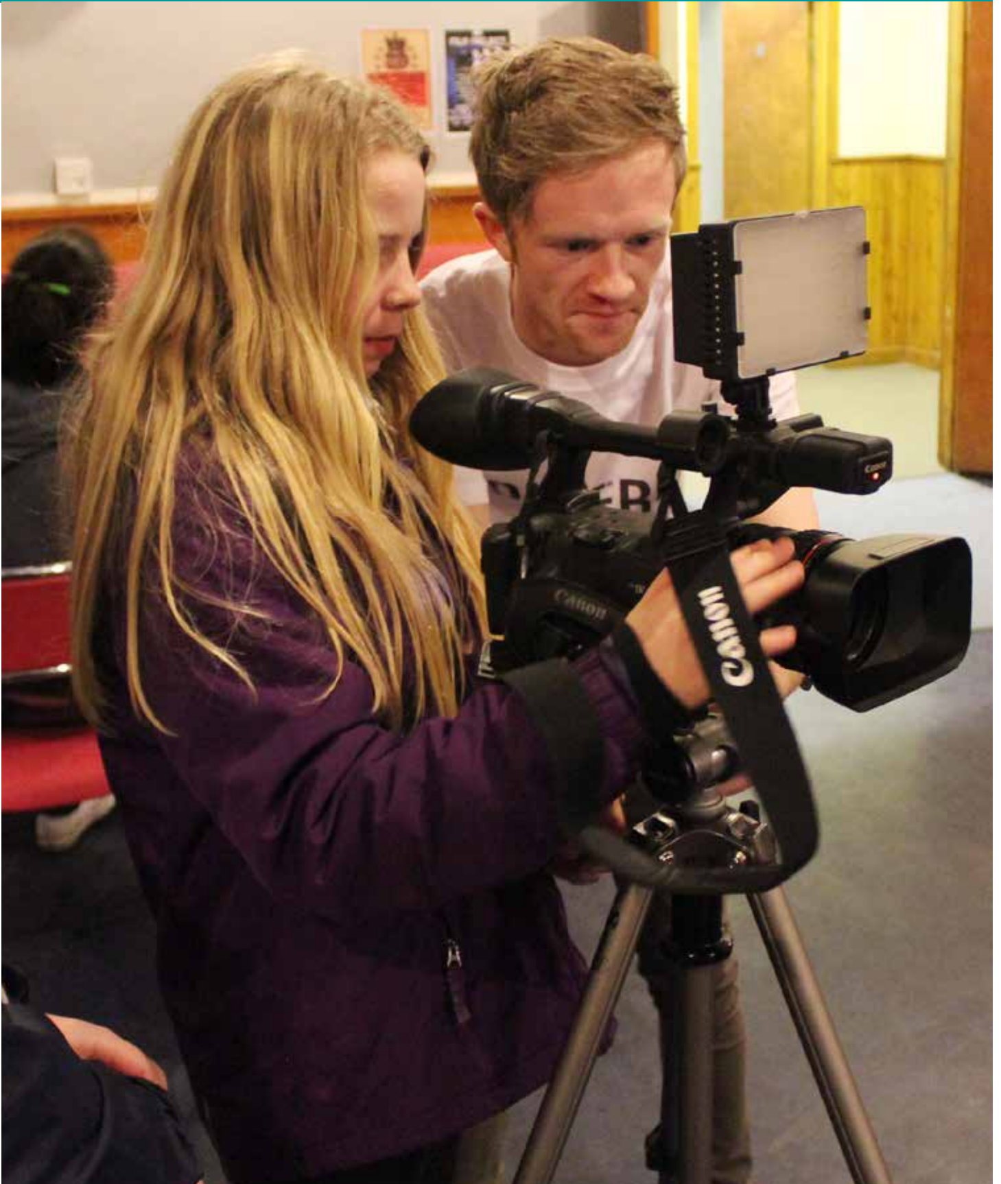
"Lights, Camera, Action!"