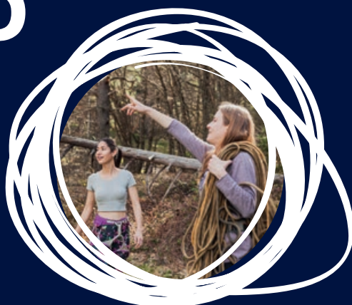
Communication and leadership skills