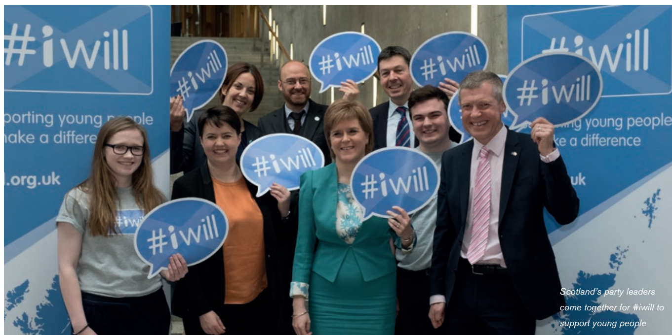
Scotland's party leaders come together for #iwill to support young people

77% of leavers progressed to employment, further learning or training