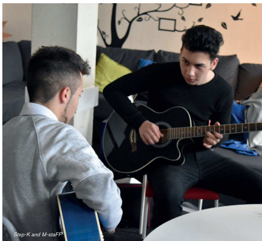
Step-K and M-staff